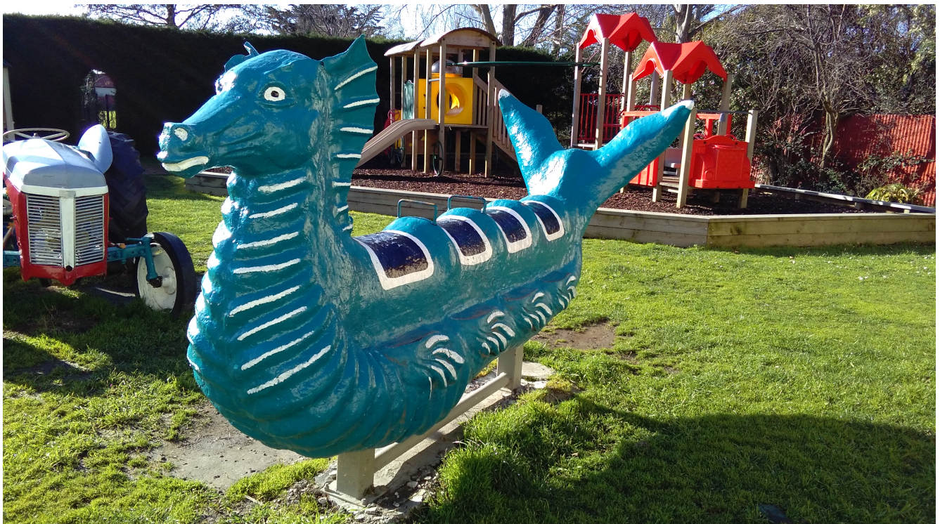
A dragon swing in Sumner